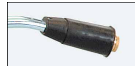
Quick disconnect nozzles are color-coded for quick and easy changing between 15°, 25°, 40° spray nozzles

50-ft. high-pressure hose for easy maneuverability around a large working area