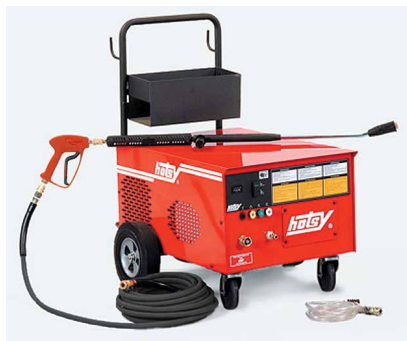
Model 1720 shown with optional optional wheel kit & chemical rack