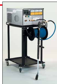
1700 Series with optional hose reel kit, Tall Floor Stand, caster wheel kit and stainless steel base and cover.