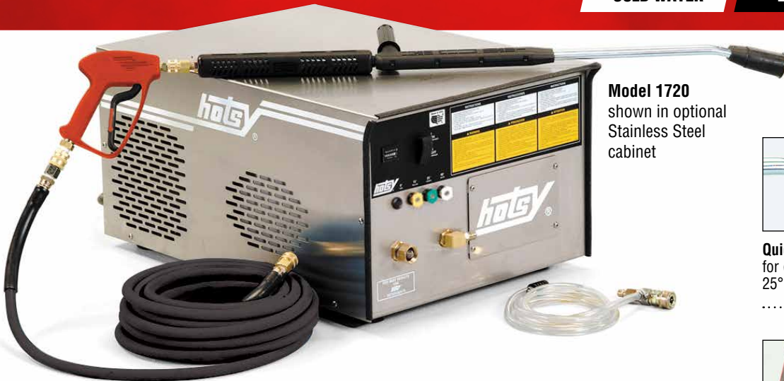
Model 1720 shown in optional Stainless Steel cabinet